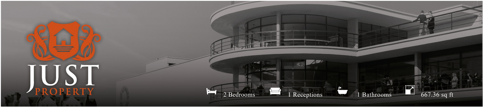
Flat 3, 115 Hastings Road, Battle, TN33 0TH